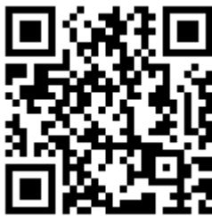
Figure 4-1: QR code to the Rohde & Schwarz support page

Contact our customer support center at www.rohde-schwarz.com/support , or follow this QR code: