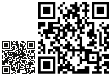
Figure 4-1: QR code to the Rohde & Schwarz support page

Contact our customer support center at www.rohde-schwarz.com/support or follow this QR code: