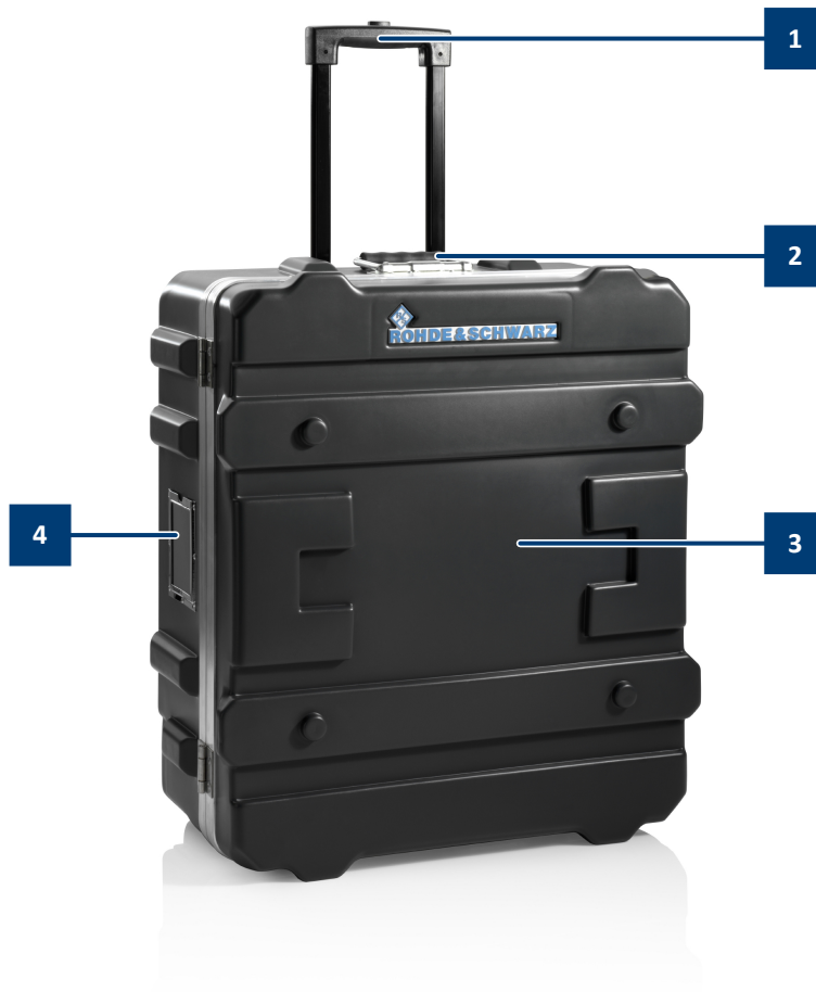
Figure 1-1: R&S ZZK-Case in upright position with pull-out handle