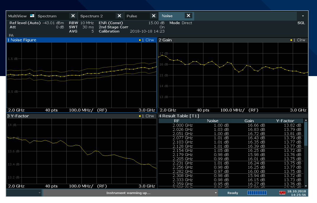
Fig. 1: Noise figure and gain measurement with R&S<sup>®</sup>FSx-K30 application firmware. In addition to the result table, the noise figure traces and the calculated gain, the Y factor can also be displayed.

The R&S<sup>®</sup>FS-SNS smart noise sources are connected to the analyzer via a 7-pin cable for power supply and control interface. An adapter cable is supplied for instruments not equipped with the necessary connector. When connected to a spectrum analyzer equipped with the application firmware R&S<sup>®</sup>FSx-K30 noise figure measurements (Fig. 1), the instrument handles all needed parameters automatically (Fig. 2).