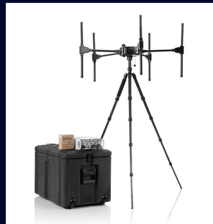
Transportable monitoring station with the R&S®UMS400 and the R&S®ADD307 collapsible VHF/UHF DF antenna with accessories

Small scale EW operations include emitter hunting missions and long-term monitoring missions close to targets, with light EW teams, embarked or disembarked. Carried out often in isolation or out of EW reachback, in harsh environments; these missions require equipment that offer autonomy, reliability and ruggedization. The R&S®UMS 400 operational concept synthesizes demanding EW tactical requirements and RF performance.