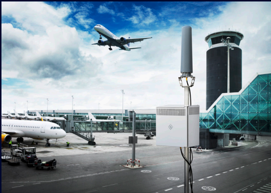
Fixed monitoring station with the R&S®UMS400 and the R&S®HE600 active receiving antenna

Spectrum monitoring helps verify compliance with licenses, regulations and communications standards and facilitates network management and planning. The R&S®UMS400 universal monitoring system in combination with Rohde&Schwarz monitoring and direction-finding antennas is the basis for fixed and mobile spectrum monitoring stations. With R&S®ARGUS spectrum monitoring software, several stations equipped with the R&S®UMS400 can be networked for radiolocation and other monitoring tasks such as automated detection, identification and localization of interfering signals and unlicensed emissions. In addition, the R&S®UMS400 supports the measurement of signals in line with ITU Recommendations.