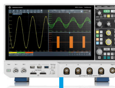
MXO series oscilloscope