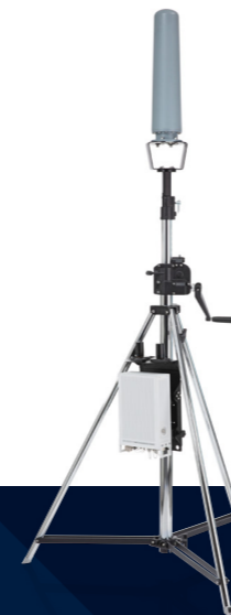
ARDRONIS Detect ▶ detect / identify