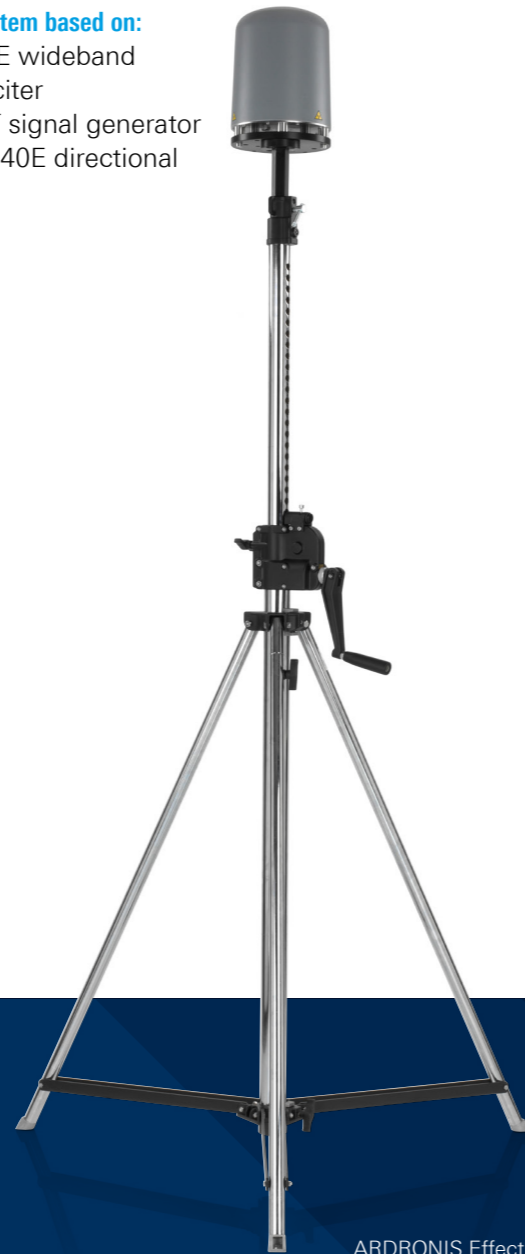
ARDRONIS Effect ▶ detect / identify ▶ disruption