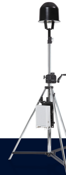
ARDRONIS Locate Compact ▶ detect / identify ▶ locate / track drone