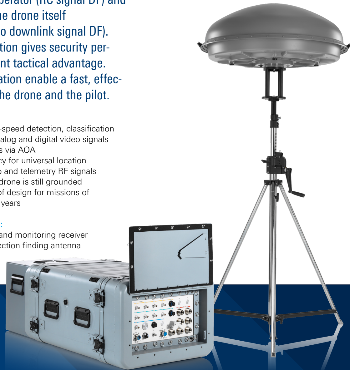
ARDRONIS Locate Advanced ▶ detect / identify ▶ locate / track drone and pilot