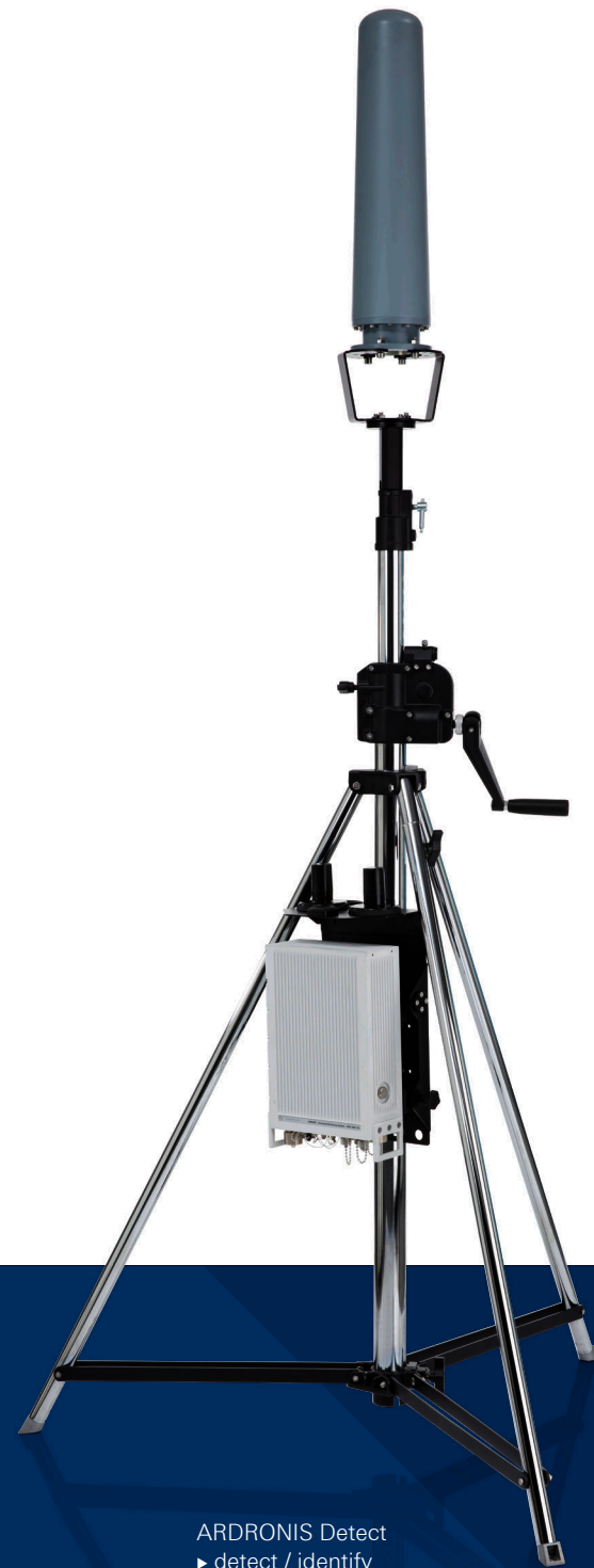
ARDRONIS Detect ▶ detect / identify