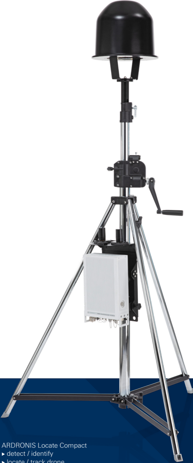
ARDRONIS Locate Compact ▶ detect / identify ▶ locate / track drone