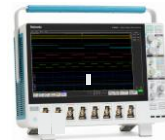
Tek 5 Series MSO (6 channels)

The typical MSO configuration consists of 4 analog and 16 digital channels. 16 digital channels can be retrofitted to the 4-channel R&S® RTE base unit via the MSO interface at a very attractive price.