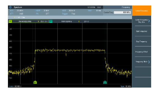
R&S°FPC1000, 10.1" display with 1366 x 768 pixel resolution.

Its light weight and low power consumption make the R&S®FPC1000 ideal for rack integration, too.