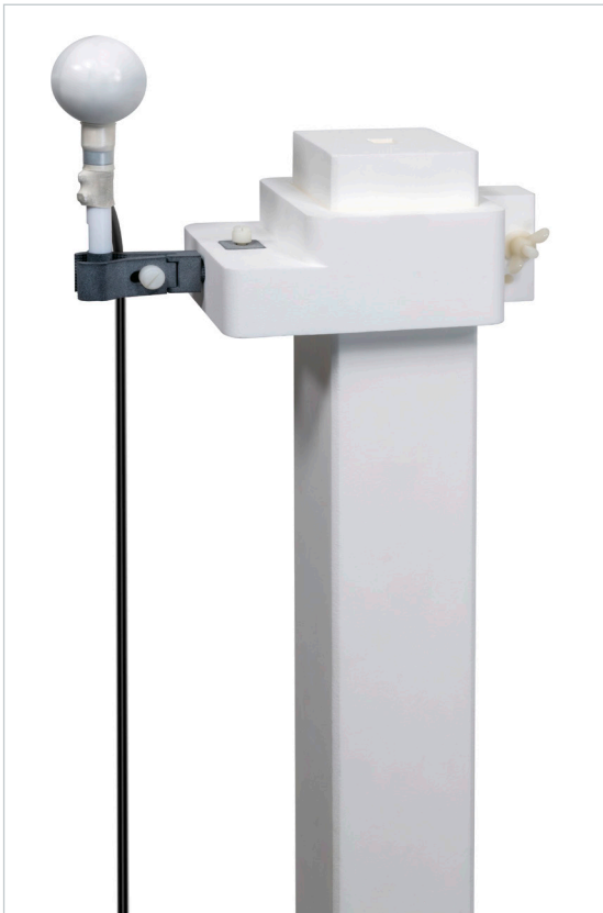
R&S®FPAS-PA1 adjustable probe arm