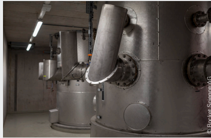
The chimneys waste incineration plant.