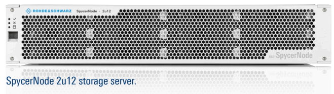
SpycerNode 2u12 storage server.