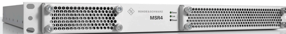
The R&S®MSR4 multipurpose satellite receiver of the R&S®SATCOM Link Observer

www.rohde-schwarz.com | www.rohde-schwarz.com/support | www.training.rohde-schwarz.com