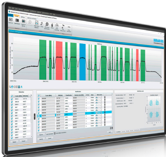
The R&S®GSACSM software core of the R&S®SATCOM Link Observer