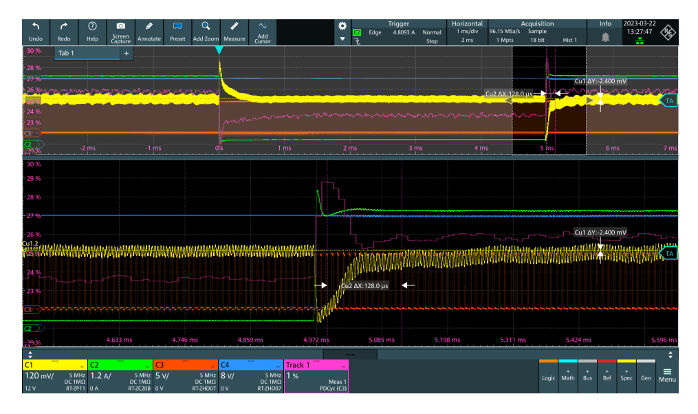
Figure 3: Load transient setup of a step-down converter

Reviewing control theory shows the 2% deviation comes from higher conduction losses caused by higher output current. The higher losses are mainly generated in the transformer and output rectifier. The additional losses need to be equalized by increasing the positive duty cycle and the track function allows this complex measurement task to be performed.