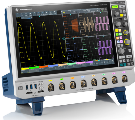
R&S®MXO 5 oscilloscope

Validating switching converter stability is vital for any power supply design. Frequency loop and load transient responses are often used to ensure switching converter stability. Even as frequency loop response becomes more important to design validation, load transient response is still commonly used. Load transient response can also be enhanced by visualizing the positive duty cycle for pulse width modulation (PWM) signals over time. A modern oscilloscope can do this, while also helping identify unknown converter effects.