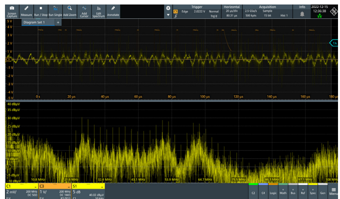
Fig. 3: EMI spectrum while SPI data is transmitted.

A confirmation can be obtained with the last step (see Fig. 3). In this measurement, the normal trigger mode is activated where the SPI communications port is measured with a passive probe (channel 3). The spectrum is displayed at the same time. The result shows that as soon as the SPI communications between the controller and receiver have started (trigger event), a high broad emission appears on the display. Knowing the details, activities can be defined to limit this emission, which is caused by SPI bus activities and reflected into the conducted emissions on the power line.