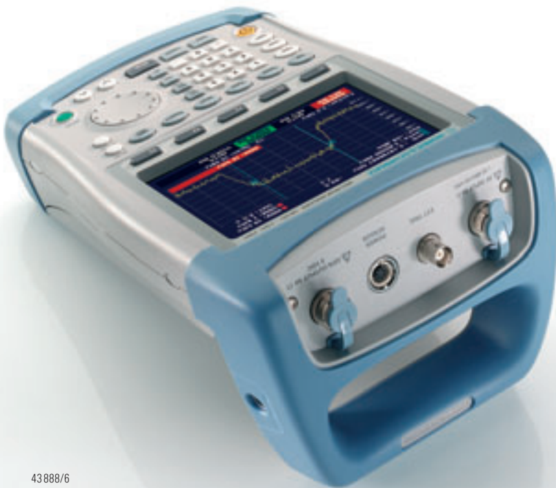
FIG 3 Connectors in the carrying handle (left to right): AC power supply connector, generator output, power sensor connector, trigger input, RF input

The RF input is particularly well protected by a combination of overvoltage arrester, PIN diodes and capacitive cou-