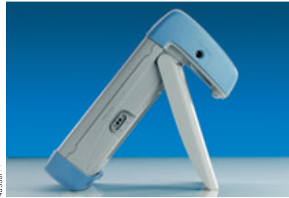
FIG 2 For optimal display viewing angle, the R&S FSH3 is equipped with a fold-out stand for placement on a desktop.

The R&S FSH3 is enclosed in a sturdy housing without air openings (as protection against environmental effects) to ensure that it will function properly even under extreme ambient conditions. Despite the enormous variety of functions this compact spectrum analyzer offers, power consumption is limited to max. 7 W to prevent the internal temperature from exceeding tolerable levels even at a maximum ambient temperature of 50 °C. This low power consumption also enables an operating time of up to 4 h with just one battery charge, and this time can be extended by means of the power down mode which ensures automatic shutdown of the unit either