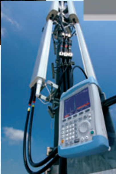
FIG 6 R&S FSH3, an all-in-one instrument for installation and on-site maintenance. Top left: measurement with Power Sensor R&S FSH-Z1, bottom left: measurements on mobile radio equipment.