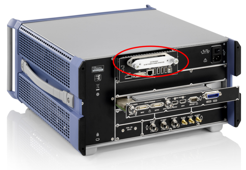
Figure 5-1: Location of the solid-state drive