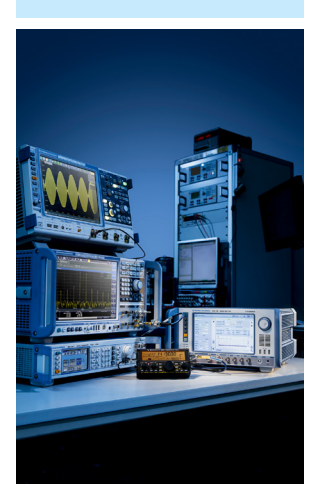
BROADCAST AND MEDIA