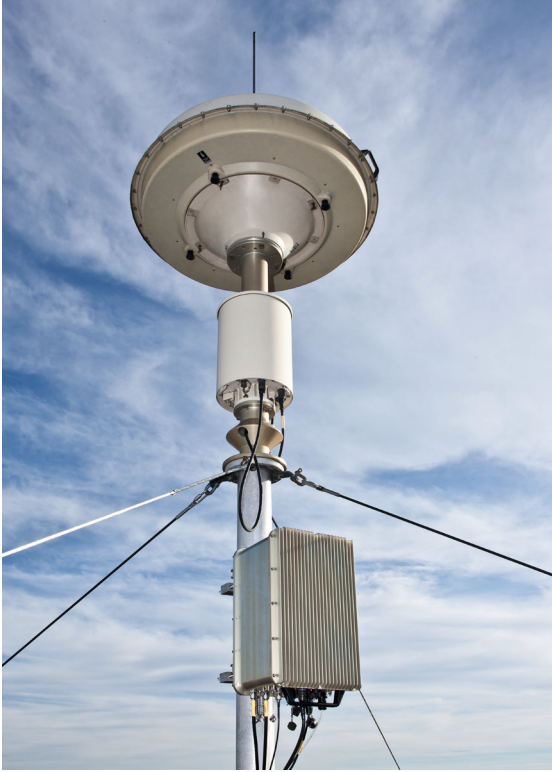
The R&S®UMS200 as a combined monitoring and DF station.