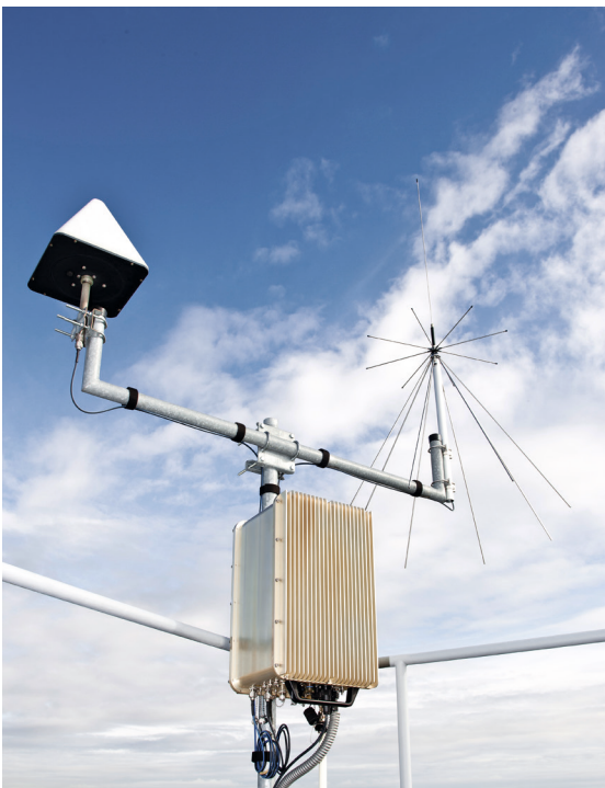
The R&S®UMS200 as a monitoring station.