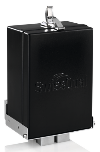
Test device containment module (TCM)

TCMs can be installed in a special vehicle roof box (VRB) with IP65 cable duct through the car roof or rear side window, or in a customized setup.