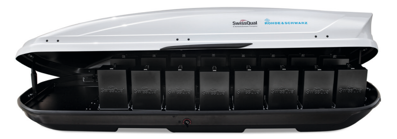
Vehicle roof box (VRB)