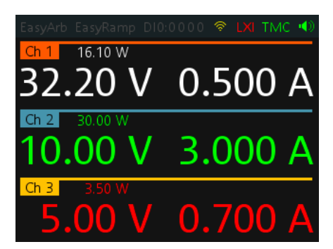
The different operating conditions are indicated by colors (example: R&S®NGE103B).