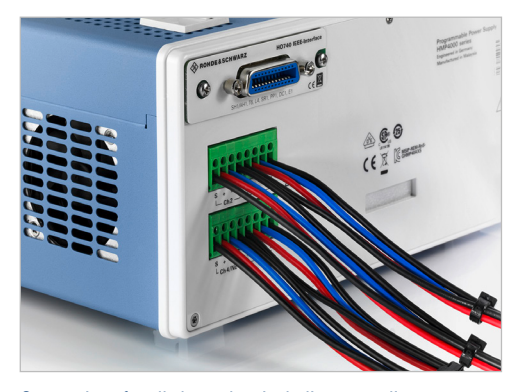
Connections for all channels – including sense lines – are also provided on the rear panel (example: R&S®HMP4040).

Advanced electronic circuitry is often very complex and sensitive to interference on the supply lines. In order to supply interference-free voltage to such sensitive DUTs, the power supplies must provide extremely stable output voltages and currents. All types of ripple and noise need to be avoided. The R&S®NGA/NGL/NGM/NGU power supplies have linear regulation and are ideal for sensitive DUTs.