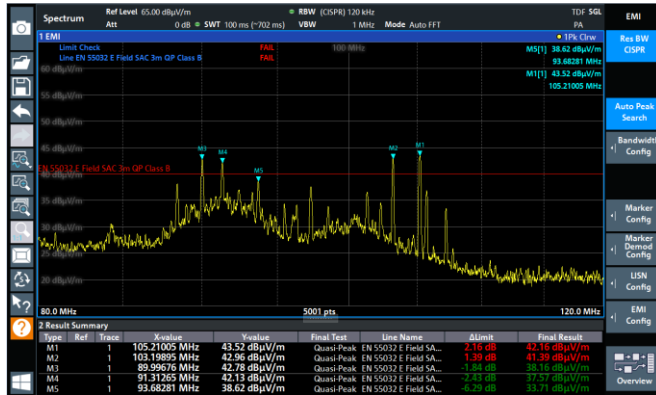
Max. peak detector-based signal sweep (top) and quasi-peak detector-based disturbance maxima analysis (bottom)