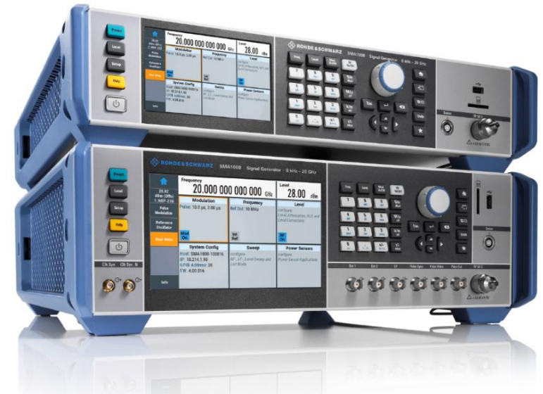
R&S®SMA100B signal generator

The R&S®SMA100B signal generator is the leading solution for analog RF and microwave signals with high output power. Not only does it produce signals at \geq +35 dBm (measured over the entire frequency range of a 6 GHz instrument with the R&S®SMAB-B32 ultra high power option), it does so while maintaining the signal quality. The level accuracy and repeatability of the signals are exceptional, meaning it produces the signals at the desired power level, time after time. The harmonics are exceptionally low, which minimizes any unwanted spectral components. With this performance, the R&S®SMA100B eliminates the need for external amplifiers and filters and delivers accurate, repeatable signals. This directly translates into more accurate, repeatable and trustworthy test results.