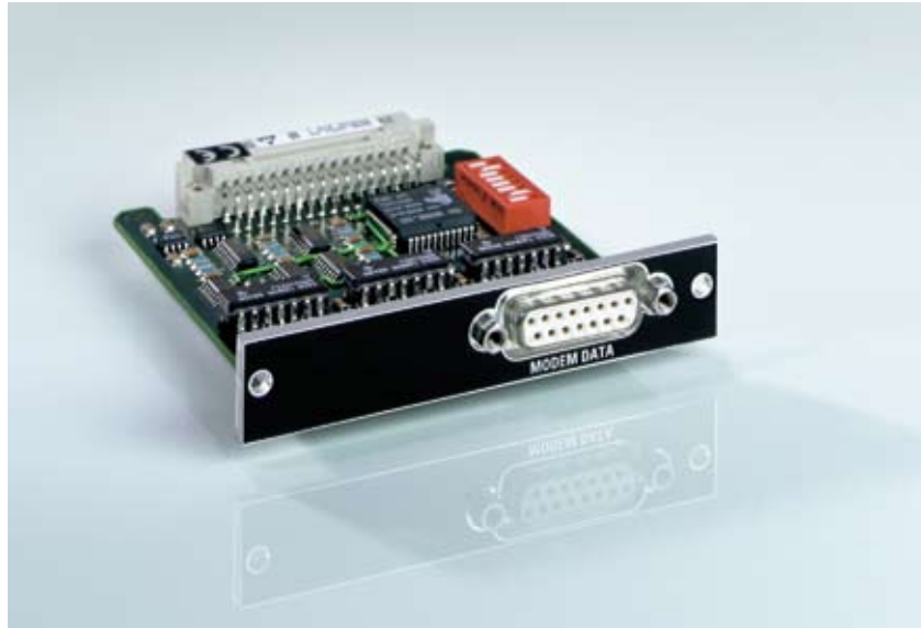
Modem Data Interface R&S®GV 2130

This interface is used for system applications where an internal R&S®GM 2200 modem is operated with an external ARQ mechanism (e.g. STANAG 5066 system processor).