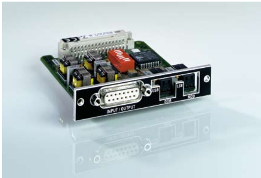
Data Link Interface R&S®GV 2120

In addition to and independently of the standard data and audio inputs/outputs of the R&S®XK 2000 transceivers, the R&S®GV 2120 supplies the levels required for data link at a separate 15-contact D-Sub connector.