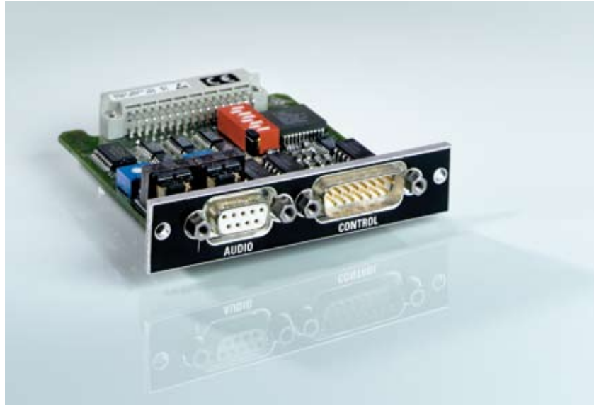
Modem Interface R&S®GV 2100

It performs level matching at the AF for different types of modems as well as configuration of the PTT line (V.28/TTL). This interface is not required for operation with the internal HF Modem R&S®GM 2200.