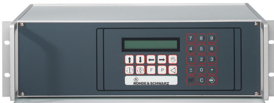
Control section and LC display of R&S®GB130