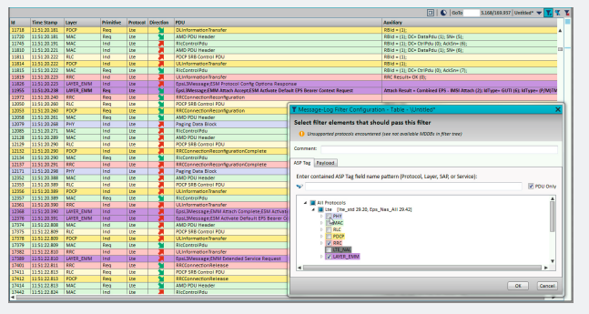
Table view of all recorded messages sorted by timestamp, with the option to search and filter according to specific criteria.

UE capability summary shows the test device's supported features and capabilities at a glance.