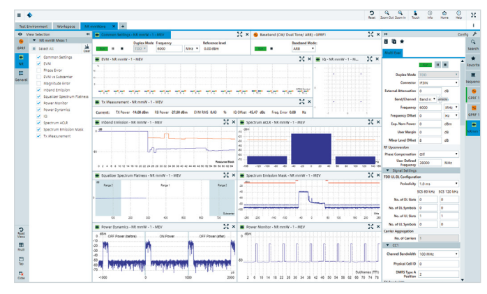
Web based GUI

The ARB generator function allows users to play predefined waveforms and CW signals. Any 5G NR FR2 signals can easily be generated.