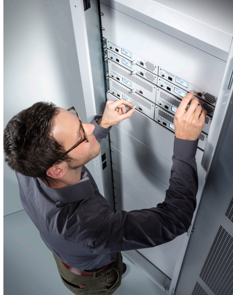
R&S®Series5200 radios in an R&S®KG5x00 rack during operation.

The perforated rear panel and door ensure that a fully equipped R&S®KG5x00 is sufficiently cooled at room temperature. In addition, several racks can safely be set up next to each other without this affecting performance.