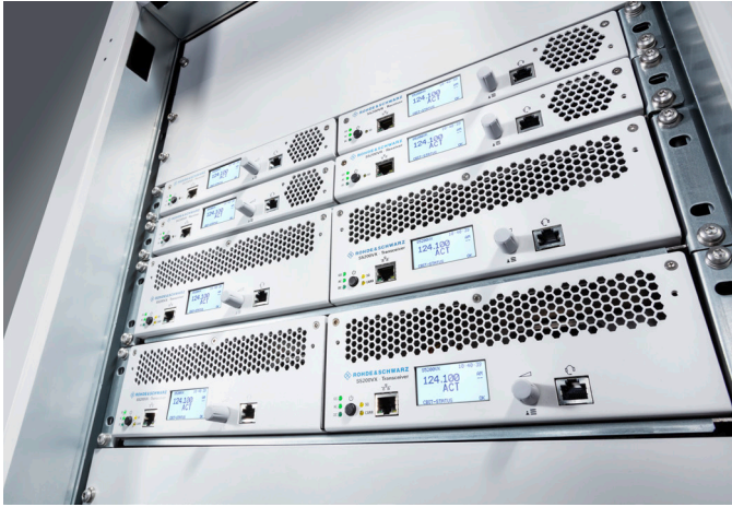
The R&S®KG5x00 rack was developed with the R&S®Series5200 radios in mind.

The R&S®KG5x00 system rack is a universal 19" standard rack. The basic configuration is a 42 or 46 height units (HU) empty rack. It can house a fully equipped radio system consisting of the R&S®Series4200, R&S®Series4400, R&S®Series4100 and, most recently, R&S®Series5200 radios.