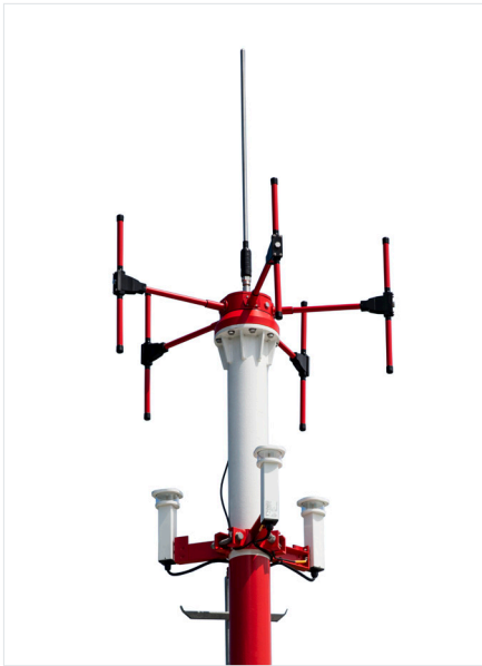
R&S®ADD317 installed on a mast at an airport