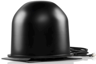
R&S®ADD107 with the R&S®ADD17XZ3 vehicle adapter and R&S®ADD17XZ5 cable set