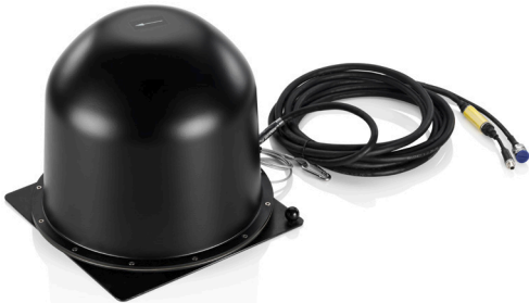
R&S®ADD207 with the R&S®ADD17XZ3 vehicle adapter and R&S®ADD17XZ5 cable set