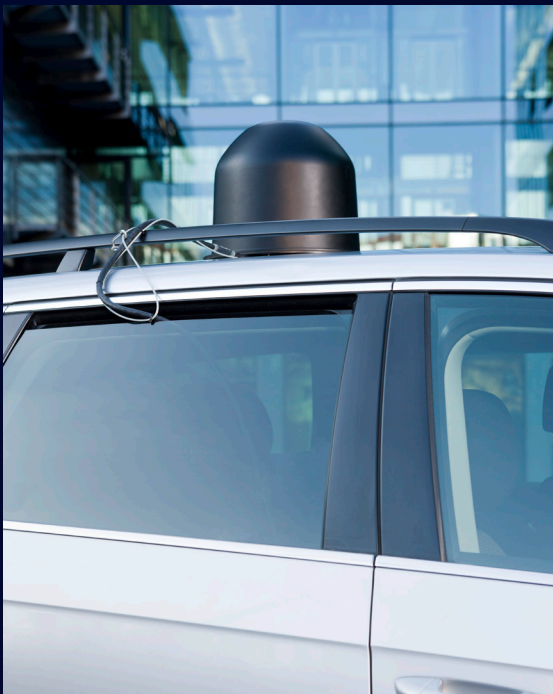
R&S®ADD107/R&S®ADD207/R&S®ADD207P temporarily installed on a vehicle roof

The R&S®DDF1555X06 transport case and R&S®DDF1555XCH carrying harness can be used to transport all the equipment required for a temporarily deployed DF station.