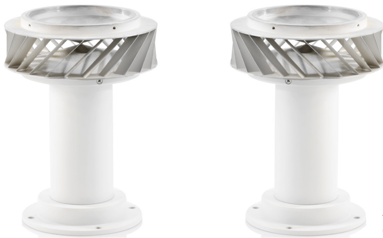
Antennas without weather protection cover.