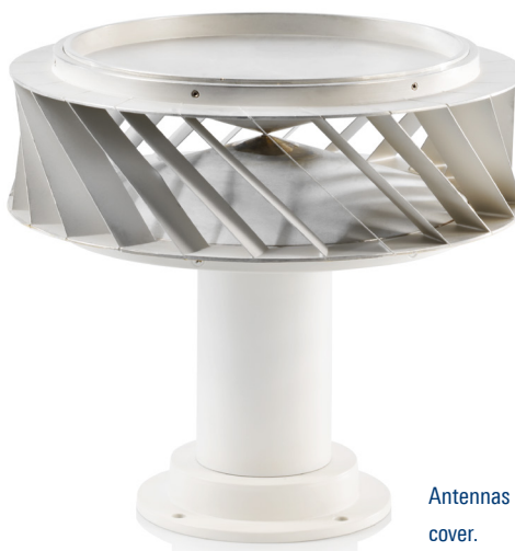
Antennas without weather protection cover.