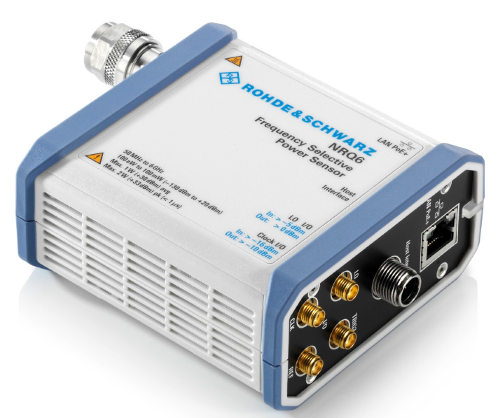
R&S®NRQ6 frequency selective power sensor

During development of MU-MIMO antenna arrays, the beamforming algorithms undergo steady revision. Whether used in regression testing or verification of newly introduced features, fast beamforming verification helps to speed up R&D for beamforming antennas and improve performance of your product.