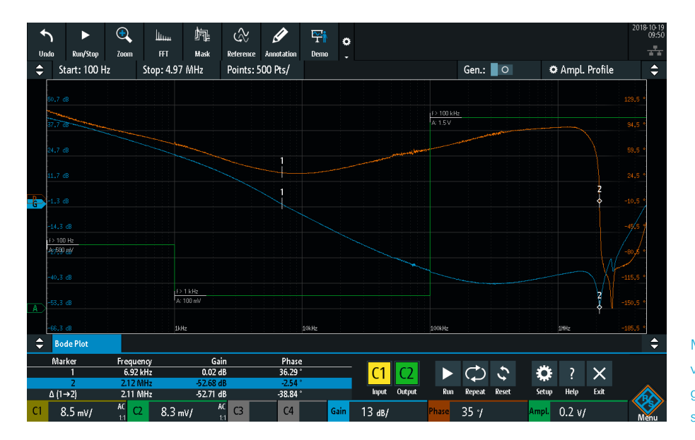
Measurement of the stability of a DC/DC converter (blue trace: gain; orange trace: phase; green trace: amplitude profiling of the stimulus signal)

View the results in a table. The measurement results table provides detailed information about each measured point (frequency, gain and phase shift). When using markers, the associated row of the result table is highlighted. For reporting, quickly save screenshots, table results or both to a USB device.