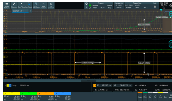
Fig. 3: PWM details in steady state of the converter

This complex measurement is only possible with the large memory of the R&S®MXO 4. Only 80 Mpoints of the 400 Mpoints of available memory were used. Longer startup sequences or higher sampling rates can also be verified.