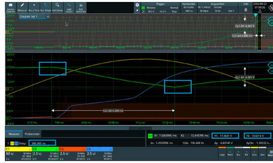
Fig. 2: Startup sequence measurement of the converter

The PWM pulses (channel 3) illustrate how the controller works in detail. Another zoom window of the same measurement data highlights the PWM pulses in the converter steady state region (see Fig. 3). Moving the cursor over the area reveals the frequency for the steady state. The zoom can be adjusted for other important points in the sequence.