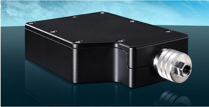
R&S®NRP33SN-V thermal vacuum chamber compatible power sensor

In the satellite sector, components, subsystems and entire satellites must be qualified in a thermal vacuum chamber before they can be used in space. This qualification proves that equipment can not only survive but also function in the harsh conditions encountered during launch and in space.