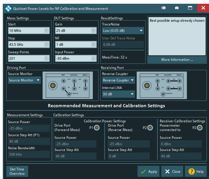
“Quickset” noise figure menu with recommendations for best measurement setup using available instrument hardware configurations and test conditions.

www.rohde-schwarz.com/appnotes/56280-1160641