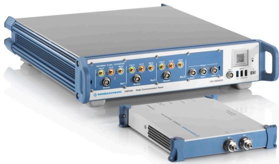
R&S®CMP200 radio communication tester and R&S®CMPHEAD30

The R&S®CMP200 is an IF tester that combines vector signal analyzer and ARB based generator functionality. Thanks to the innovative split concept, high-accuracy measurements at mmWave range are available with the R&S®CMP200 and R&S®CMPHEAD30.