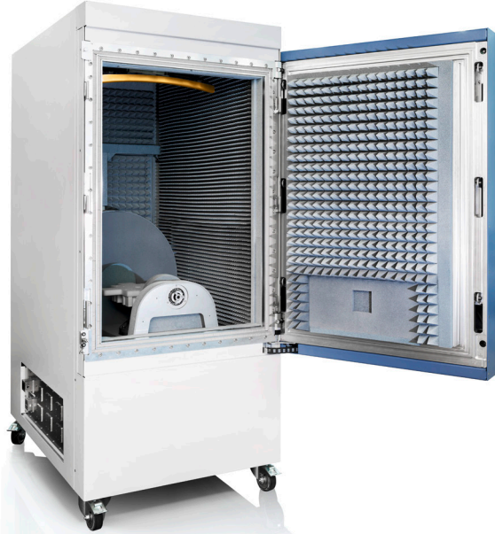
R&S®ATS1800C CATR based compact 5G NR mmWave test chamber

The R&S®ATS1800C has a unique vertical CATR design that not only has a high quiet-zone-to-footprint ratio, but also allows mounting of heavier DUTs as compared with horizontal chambers. Hence, smartphones, tablets or even laptops can be mounted and tested on the high-speed rugged 3D positioner.